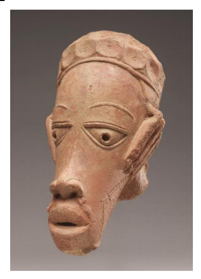
(Nok, western Sudan – modern day Nigeria 500-200 BCE)

The Nok culture that dates to around 500 BCE to 200 CE. The name "Nok" comes from a village near the place where the sculptures were found after they were washed away from their original contexts by the flooding of the Niger and Benue rivers. Most of the examples of Nok sculpture are human and animal forms. Although they are highly individualized, they are characterized by their distinctive "D" shaped eyes.