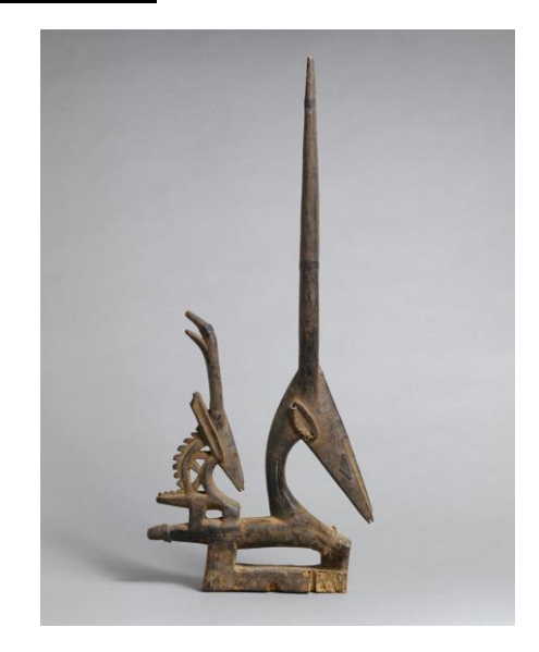
Bambara/Bamana Ci Wara, Mali, 19th – early 20th centuries

This antelope headpiece is from Mali. According to the mythology, the antelope taught humans agricultural practices.