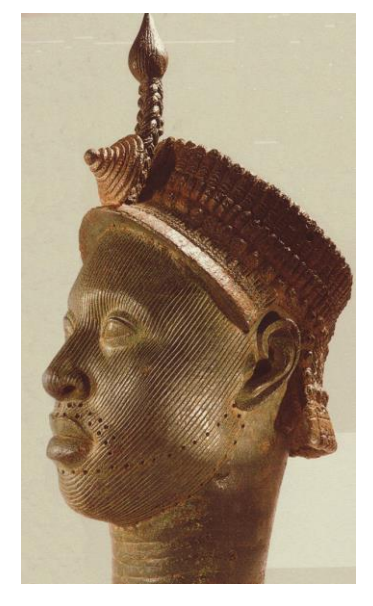
Ife Oba, Benin, 13th-14th centuries

The city of Ife began around 800 CE and remains a sacred city for the Yoruba people. This bronze, life-size head was most likely attached to a less costly, wooden body. The markings on the face are characteristic of Ife portrait heads. I am always amazed by the skill it took to make these lines. Notice how they remain consistent in spacing and depth even on the curved surfaces of the nose and other features!