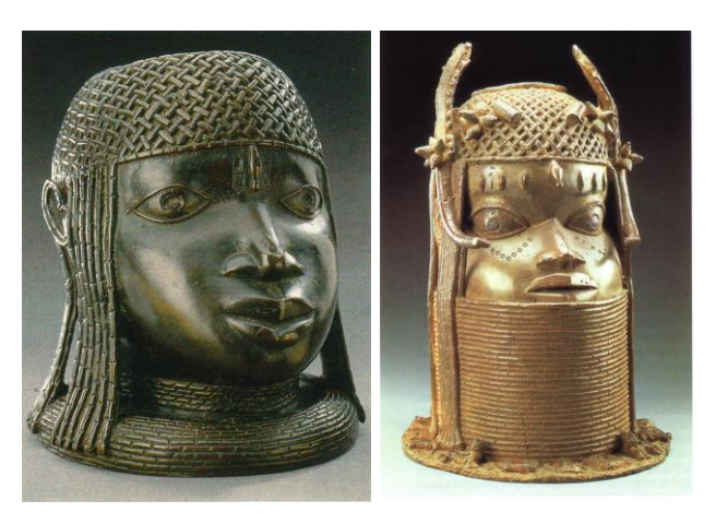
Portrait Heads of Benin Obas, early 1500s & 1897

The city of Benin arose from Ife about 150 miles to the southeast. The Benin culture became distinctly separate from Ife around 1170 CE.