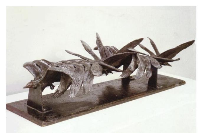
(Étienne-Jules Marey The Flight of a Gull 1887)

• This sculpture demonstrates another device artists use to suggest motion. Repetition of form gives the illusion of a bird in flight.